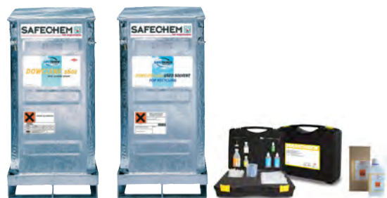
The SAFE-TAINERM System, MAXICHECKM DCL-1N Test Kit and MAXIBOOSTM ST-1 Solvent Additive

Reliable process minimises the number of rejects DOWCLENETM 1601 is used at HS Marston in combination with a new, completely sealed machine from Pero AG, equipped with an integrated distillation unit. The machine works under full vacuum. This eliminates the need for the separate explosion protection usually required for the use of flammable solvents. Additionally, operation under vacuum offers process-related advantages such as better drying and lower stress on the solvent. Cleaning process and the continuous distillation are fully automated. Supply and take-back for an environmentally responsible disposal of the solvent take place in the SAFE-TAINERM System, developed by SAFECEM. This system for transport, storage and handling, consists of two different, specially designed double-walled containers for fresh and used solvents. In combination with the new cleaning machine the SAFE-TAINERM closed-loop transfer system represents the Best Available Technology (BAT) and enables a virtually emission-free cleaning process. This helps, as well as the continuous recycling of DOWCLENETM 1601, to significantly reduce consumption. “The investment has already paid off due to the reduced rejection-rate which is now around one per-cent. Additionally, cleaning costs could be significantly reduced and the HS&E goals have also been achieved. These advantages have triggered a huge interest on the cleaning solution within the group”, Andy Lees concludes.